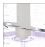
Multipurpose Hygienic Stainless Steel Blade