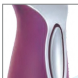
Easy Grip Ergonomic Design