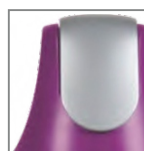
Integrate 'One Touch' Push Button Switch