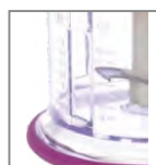
Capacity 500 ml ( 2 CUPS )