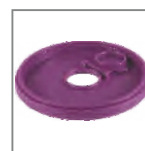
Unique Splash Guard Doubles as a Storage Lid