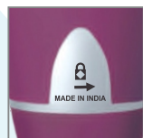
Detachable Blade Housing